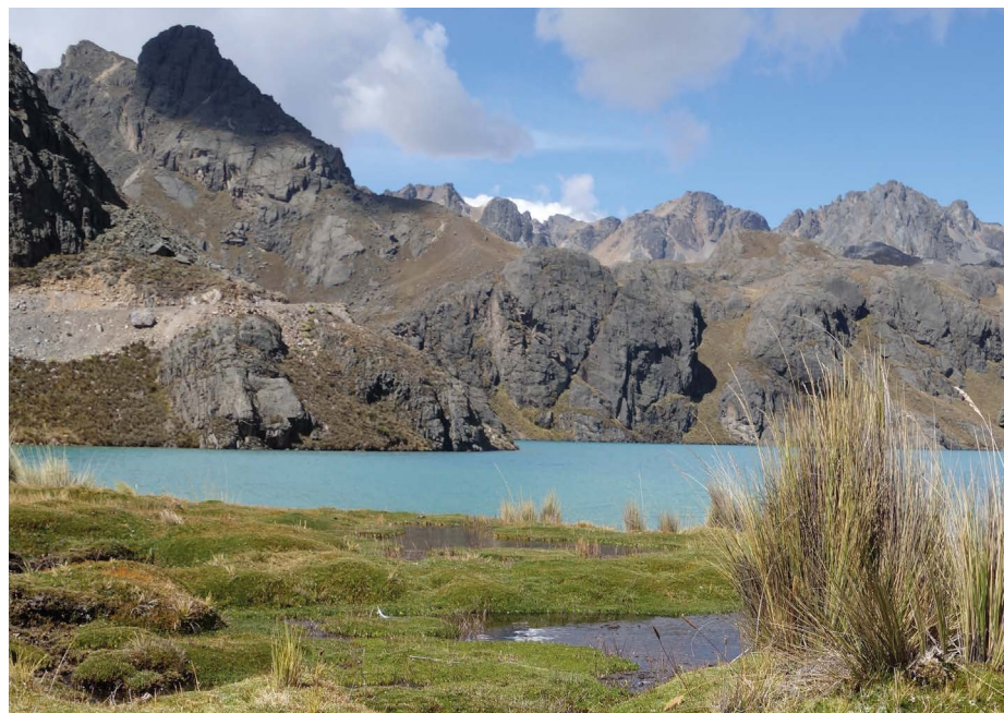
Peru's water utility companies are protecting peat bogs because of their ability to hold water.