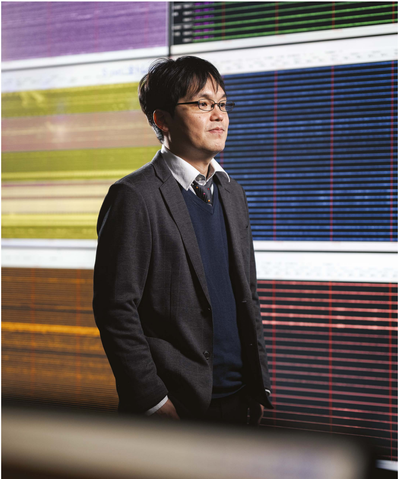
IRWIN WONG FOR NATURE