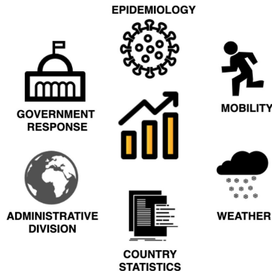
Figure 1. The main types of data categories included in the OxCOVID19 Database.

and value surveys (Fig. 1). The database uses an established spatial index GID^5 , which spans several administrative levels. Wherever possible, the OxCOVID19 Database draws upon official government sources, work by university-based or government research groups and data from peer-reviewed scientific papers. The data are provided with the different granular spatial level thereby facilitating a better understanding of how regional characteristics inform the spread of the disease (e.g. Fig. 2). Well-linked and granular data of this type can enable the construction of more accurate models of the pandemic by allowing reliable estimation of the required parameters for relatively small regions, avoiding the process of averaging them on a country level. They also increase our understanding of the efficacy of various interventions at the state and regional levels. Thus, we hope this resource in combination with mathematical modelling and machine learning for data analytics will enhance our understanding of the COVID-19 pandemic and facilitate the development of strategies to reduce the impact on society. Some of the key questions which the OxCOVID19 Database can help to answer include the assessment of the effectiveness of different types of non-pharmaceutical interventions such as government lockdowns, mobility restrictions, and social distancing in reducing the spread of infections 6 .