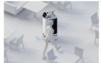
▲ Service robots — such as the PUDU A1 (above), the PuduBot 2 (top right) and the SwiftBot (bottom right) — developed by Pudu Robotics in Shenzhen, China, are becoming increasingly sophisticated thanks to AI algorithms.

technology consisting of AI algorithms that extract features from images, then match the images to build a map.